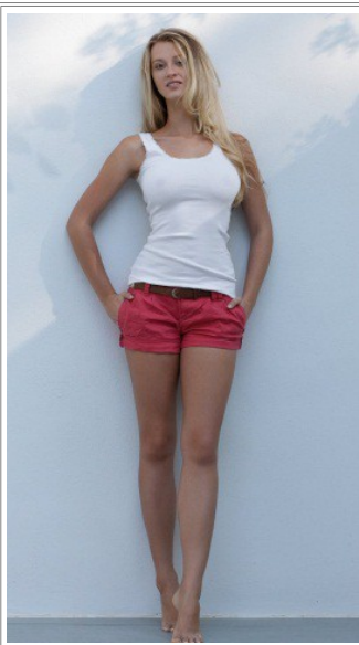
Face front clothed